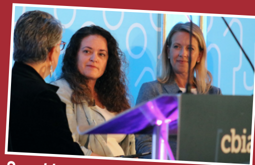
Speaking at "When Women Lead" hosted by the CT Business and Industry Association