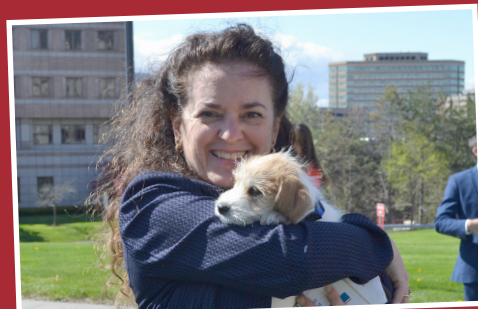
CT Humane Society "Puppy Day" at the Capitol