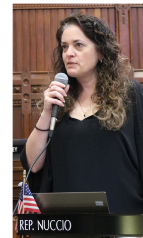
(right) Asking questions during the late evening debate on the state budget.

I voted in favor of SB 187 "An Act Concerning Cottage Food Operations." The legislation increases the revenue cap for cottage food producers from $25,000 to $50,000, effective October 1 st . As defined by the Department of Consumer Protection, "Cottage food is prepared food perceived to be low-risk for food-related injury or illness that can be prepared in a home environment without some of the controls used for a traditional ready-to-eat food such as those foods sold in a restaurant or grocery store." For more information about the state's cottage food regulations visit the DCP website at www.portal.ct.gov/cottagefood .