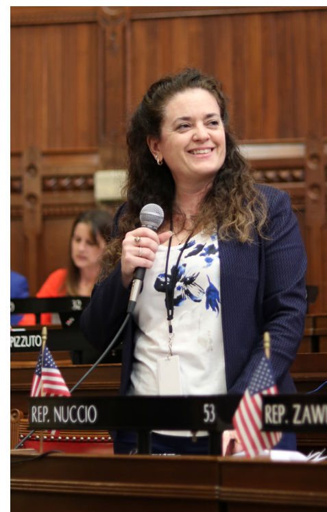
(above) Speaking in favor of HB 5001 in the House of Representatives.